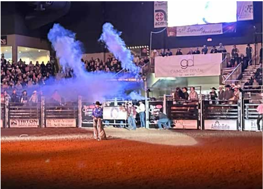
Gilmore Dental Group platinum sponsor since 2023

Ability to distribute promotional materials to the audience