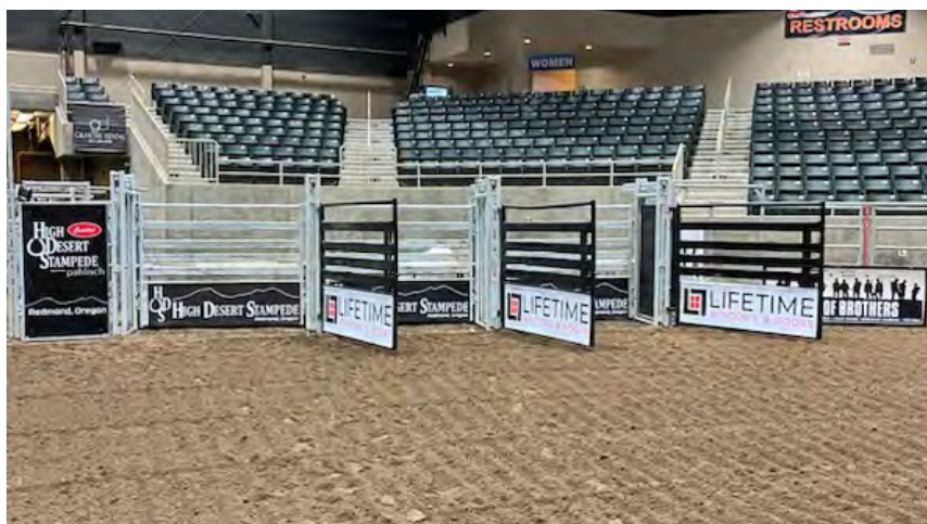
Thank You to our 2022 Chute Insider Sponsor - Lifetime Windows & Doors

6 General Admission Tickets, Thu, Fri & Sat.